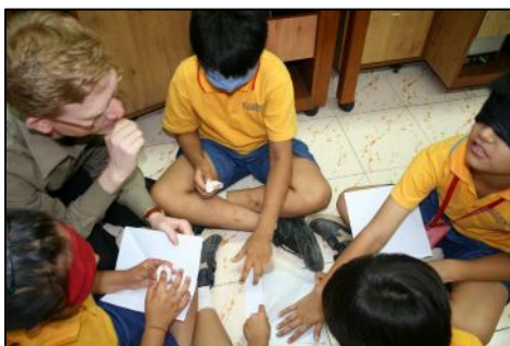
(Children at an awareness workshop Playing with clay and other craft Activities)

In addition to the mass scale awareness event the XRCVC through the year also reached out to a range of stakeholders - students, schools and corporates to spread the message of inclusiveness. Through this year the XRCVC sensitized 180 visually impaired persons on various assistive technology and changing careers and living scenarios for the visually impaired in India. Awareness of this kind amongst the visually impaired community is as crucial as the awareness within society. It is only when the two are done will we have a changed scenario in practice.