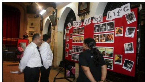
(Antarchakshu participants experiencing travelling by Bus and visiting the exhibition)